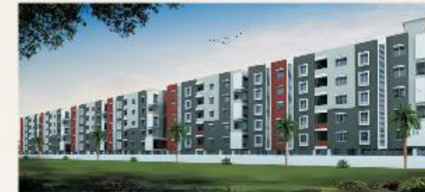
CAPITAL EDGE (200 Flats) Luxurious Coted Community Apartments NRI 'Y' Junction, MANGALAGIRI.