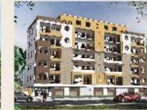
WHITEFIELD RESIDENCY (20 Flats) Whitefield Lay-out, NRI Medical College Backside, Mangalagiri