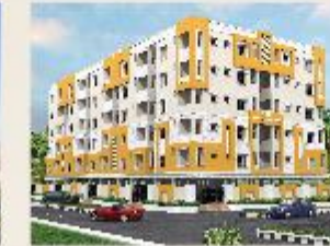
WHITEFIELD APARTMENTS (50 Flats) Whitefield Lay-out, NRI Medical College Backside, Mangalagiri