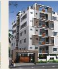
GRANDEUR (10 Flats) 1/4 Vidyanagar Guntur