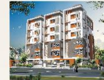
SAROJINI HEIGHTS (15 Flats) 1/17 Brodipet, Guntur.