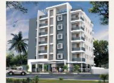
SREEVANI SOUDHA (10 - 3BHK) Amaravathi Road, Guntur.