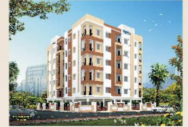
GATEWAY RESIDENCY (20 Flats) Amaravathi Road, Guntur