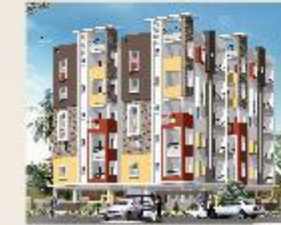
ASHUKA EMPIRE (25 Flats) 4/4 Ashok Nagar Guntur