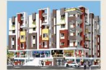
WHITEFIELD CLASSIC (60 Flats) Whitefield Lay-out, NRI Medical College Backside, Mangalagiri