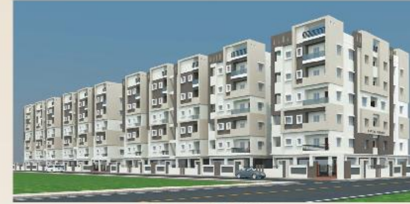
CAPITAL SQUARE (110 Flats) Beside IJM Raintree Park, Kaneru Road, Guntur